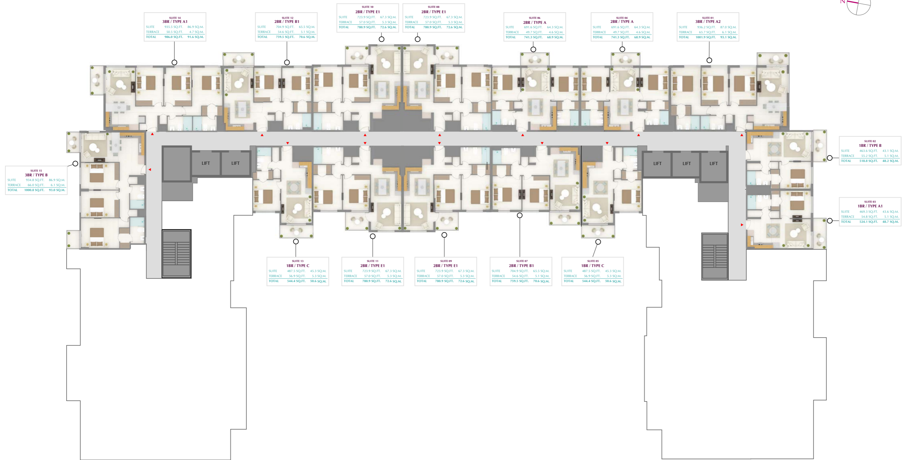
The Nook 1 - 12th Level Plan