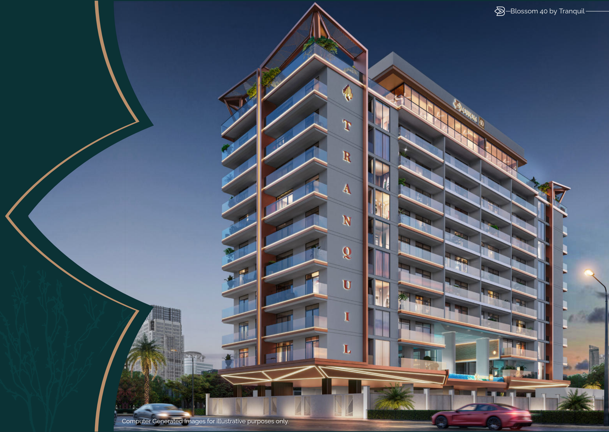
Computer Generated Images for illustrative purposes only.