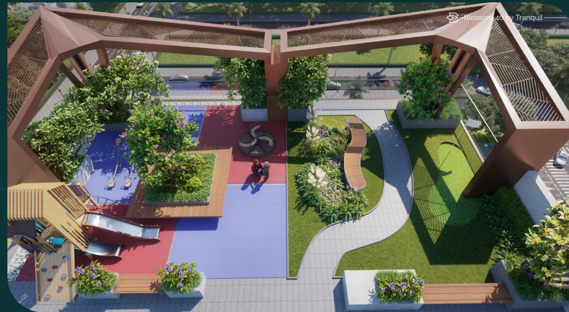
A playful outdoor zone combining a safe kids' play area with a casual golf turf, designed for active fun and easy leisure.