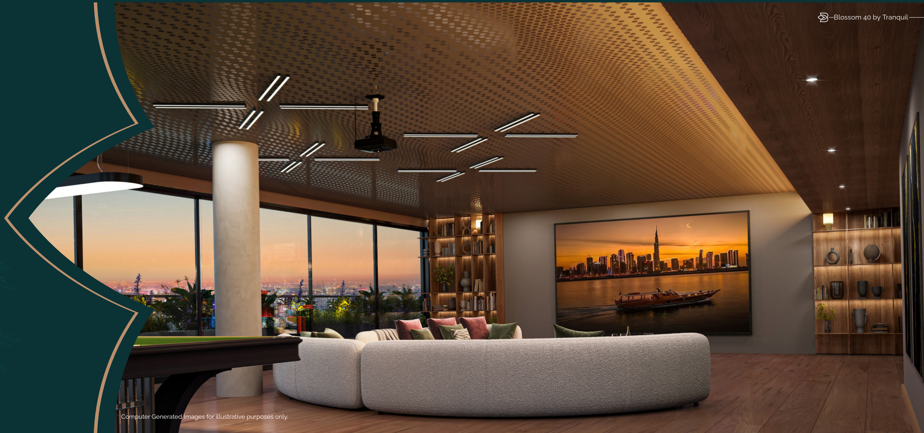
Computer Generated Images for illustrative purposes only.

A thoughtfully designed rooftop retreat where wellness, leisure, and play come together. From energising workouts and relaxed social spaces to open-air recreation for families and pets, it's a balanced escape above the city designed for everyday enjoyment.