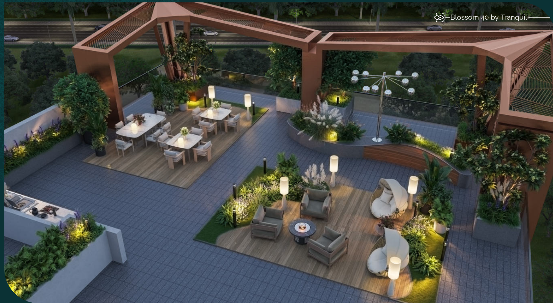
A refined rooftop lounge for effortless socialising and quiet moments, set against open skies above the city.