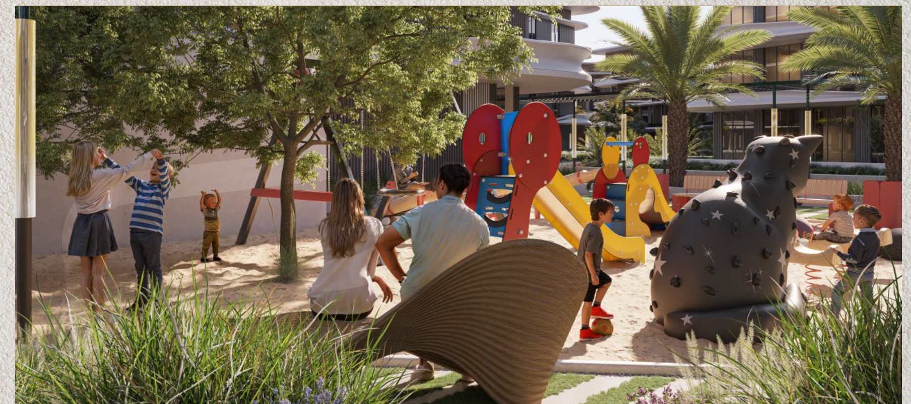
Kids Outdoor Play Area