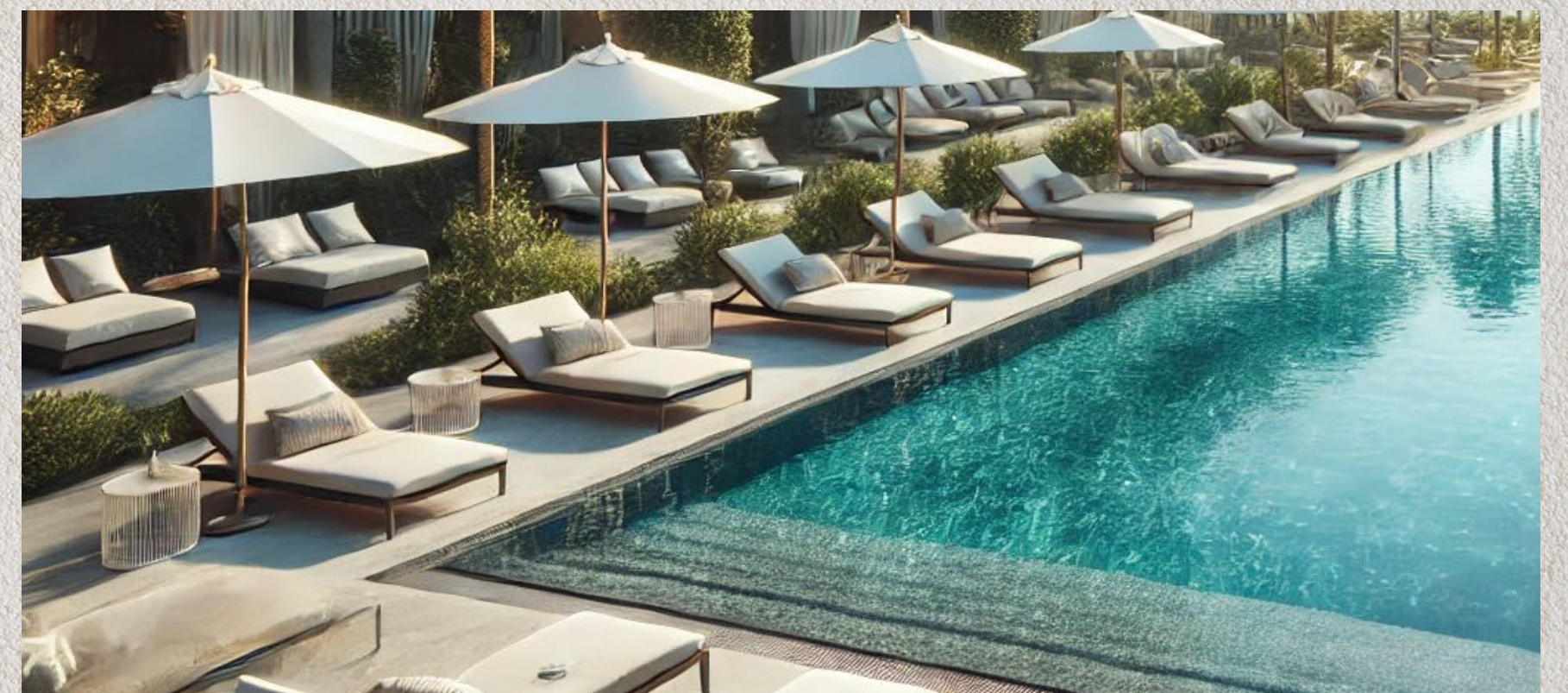
Pool Deck Sitting