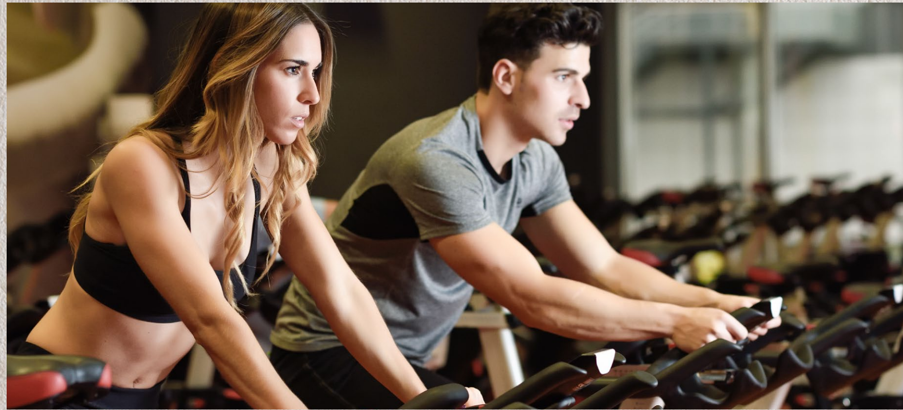
Fully Equipped Gym