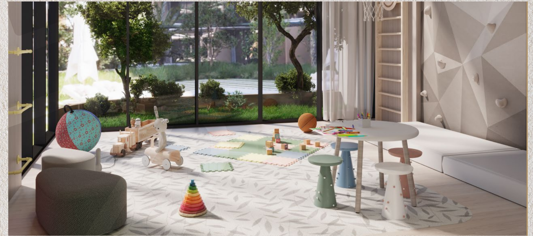
Indoor Kids Play Area