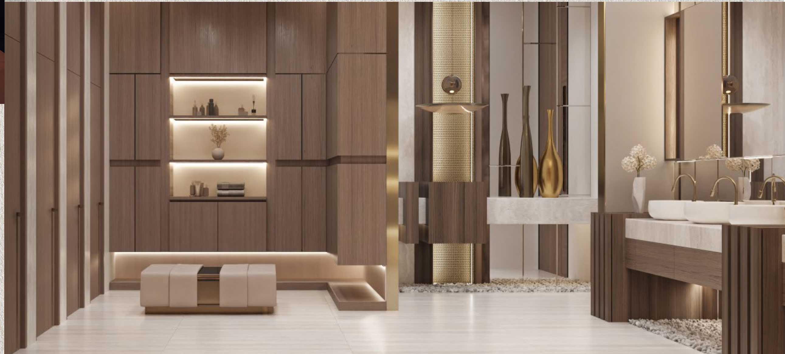
Sauna & Steam

Relax and unwind at Suna and Cinema Lounge, where serenity meets entertainment. Enjoy a soothing sauna session or immerse yourself in a cinematic experience, creating unforgettable moments with loved ones.