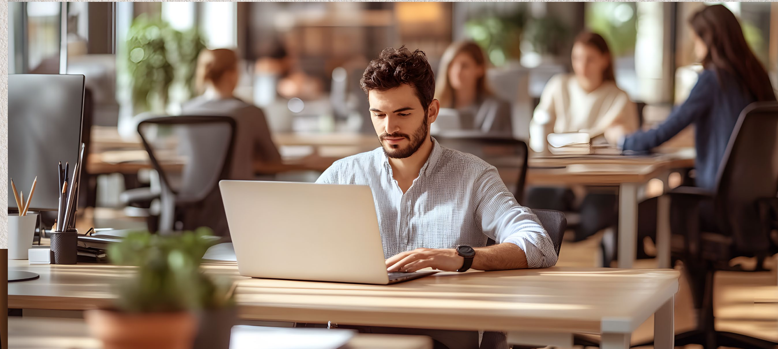
Elite Business Center

Mayfair Nexus is a tapestry of elegance and well-being, where life's finest comforts are woven seamlessly into your everyday experience. With every essential amenity at your doorstep, it offers a sanctuary of balance, ensuring that tranquility and convenience are always within reach.