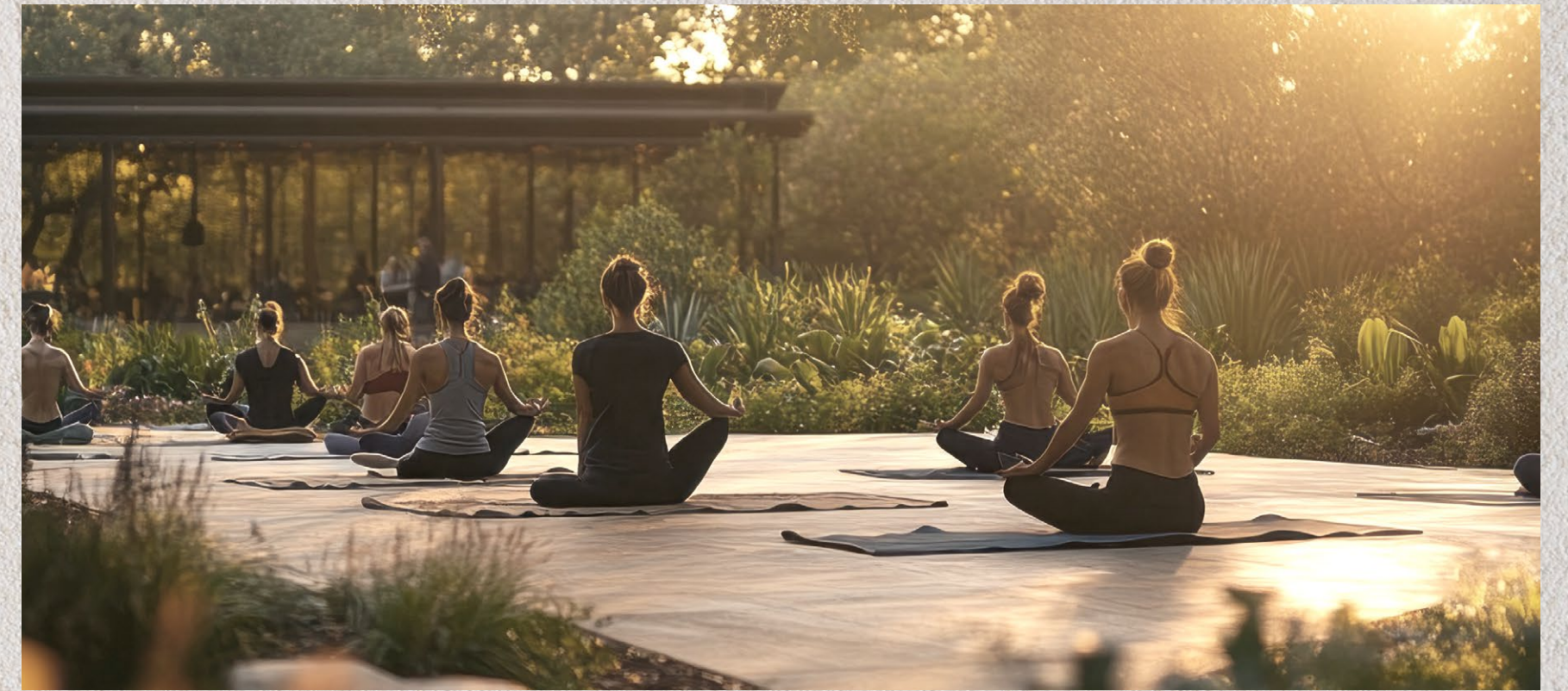
Zen Garden /Open Air Yoga Park