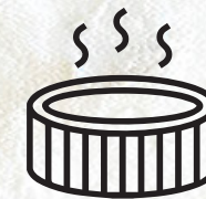
Sauna & Steam Room