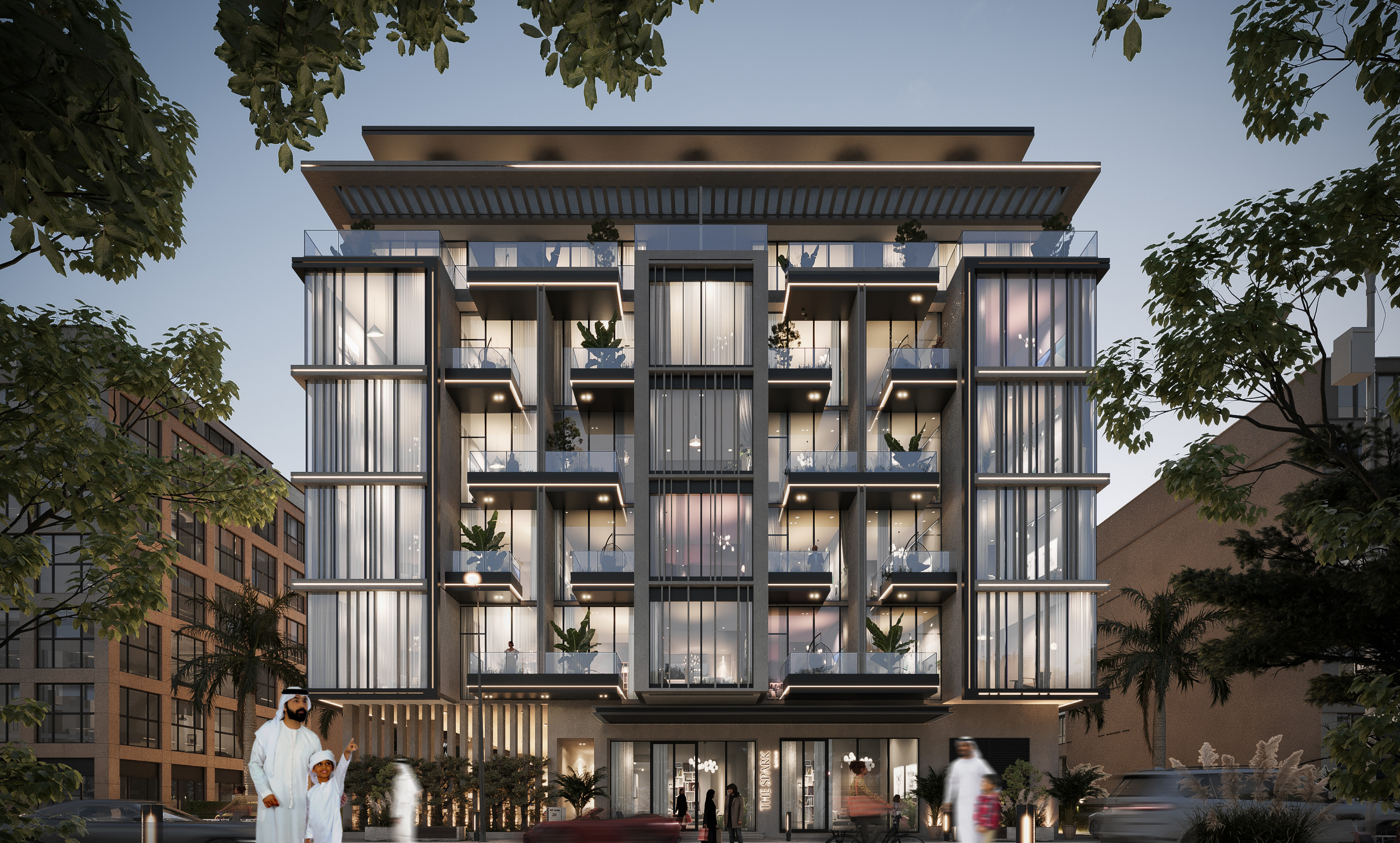
Sleek Shapes, Luxurious Spaces: A Contemporary Symphony in Design