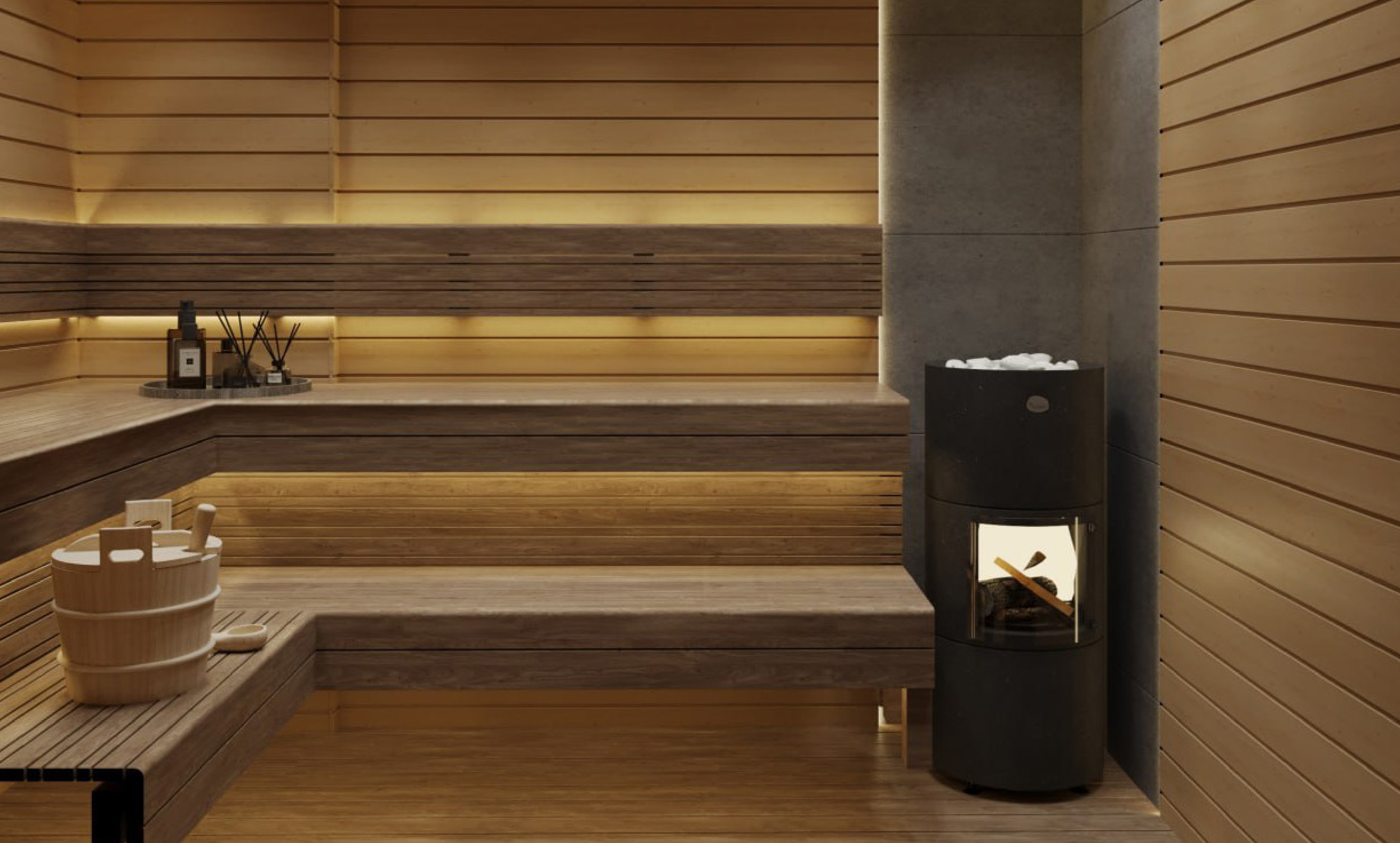
Luxury in Steam: Sauna Facilities That Define Relaxation