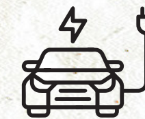
Electric Vehicle Charging Stations