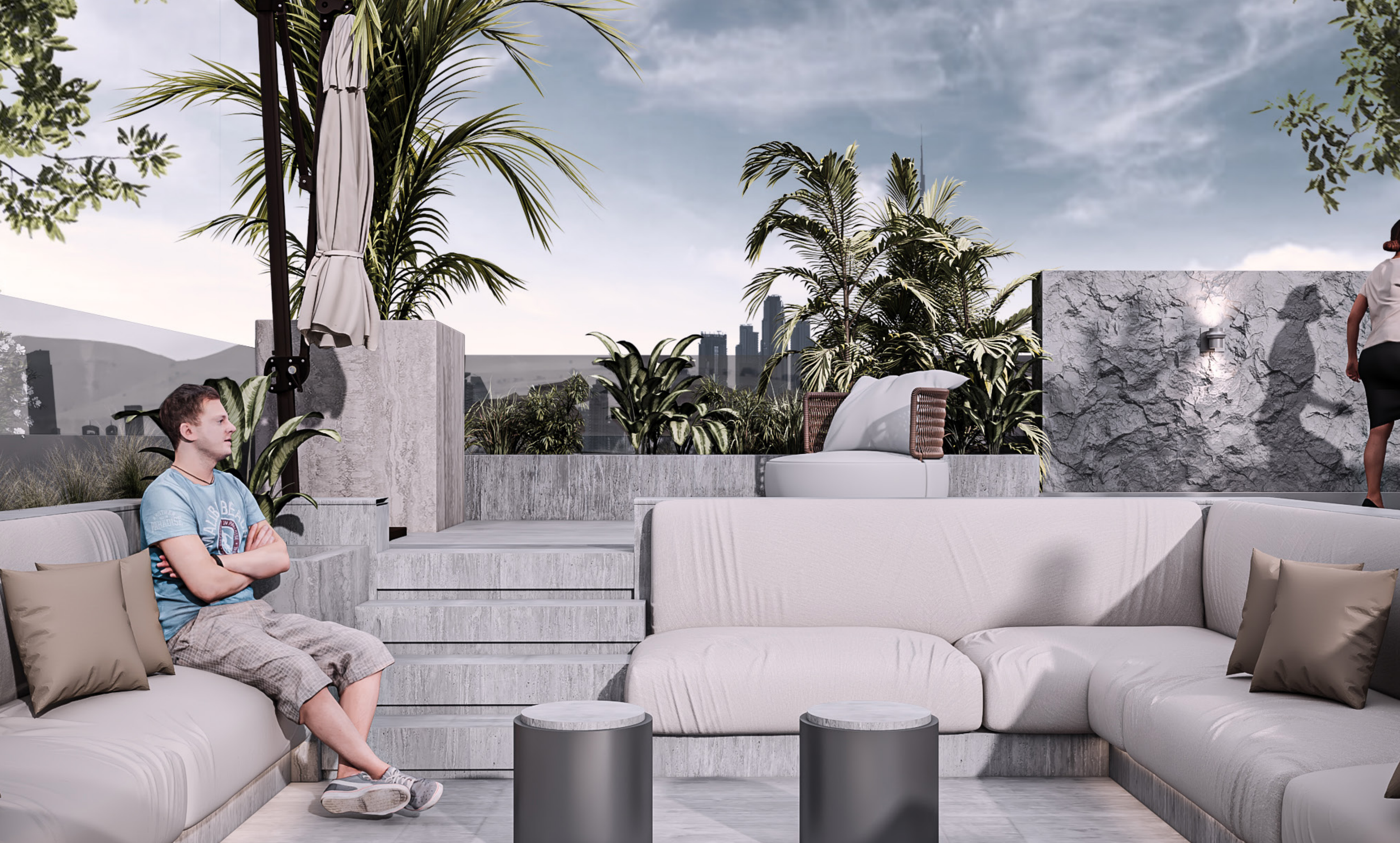
Outdoor Bliss: A Relaxing Haven Next to the Sparkling Pool