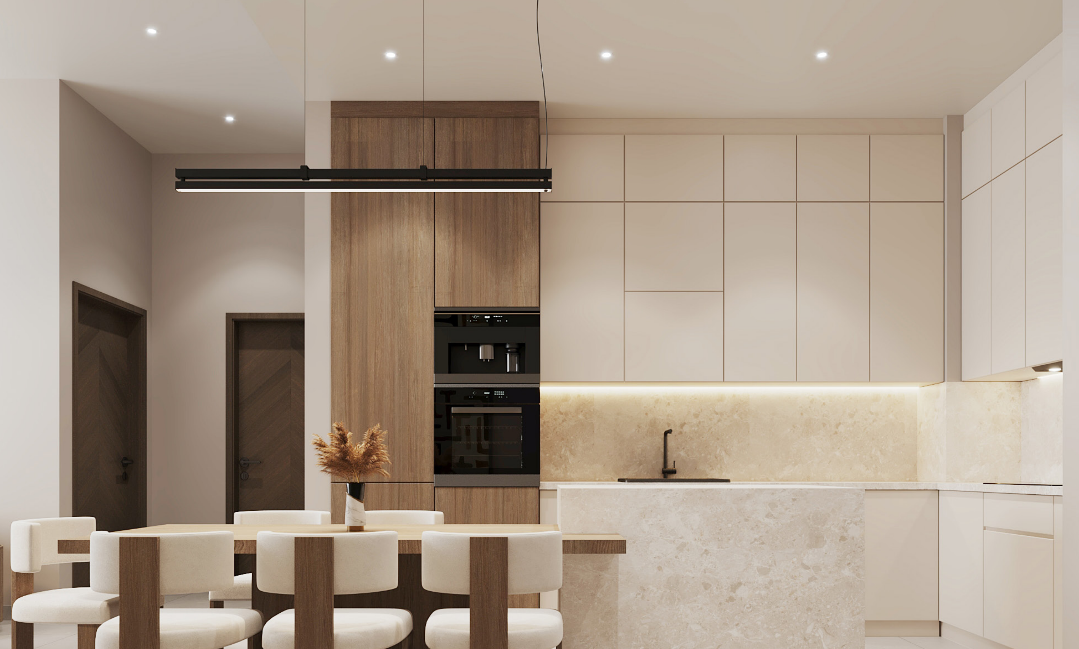
Kitchen Elegance: Modernity and Practicality in Every Detail