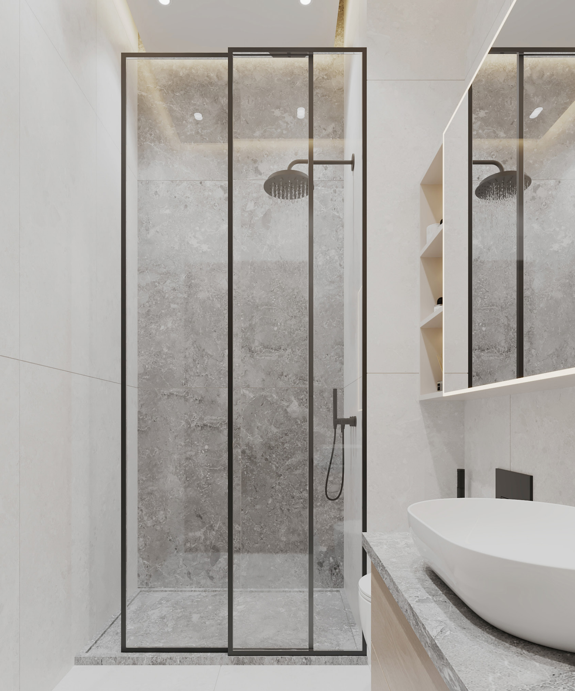
Bath in Luxury: Opulence and Practicality in Every Shower