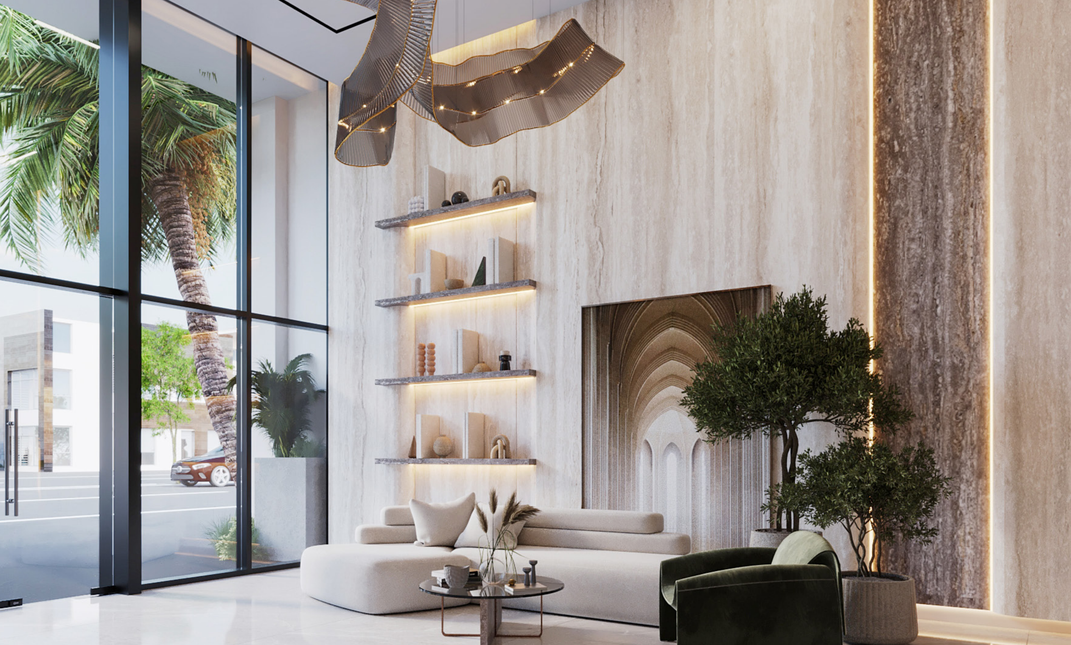
A Daylight Welcome, Luxurious Vibe: Where Sunshine Meets Opulence