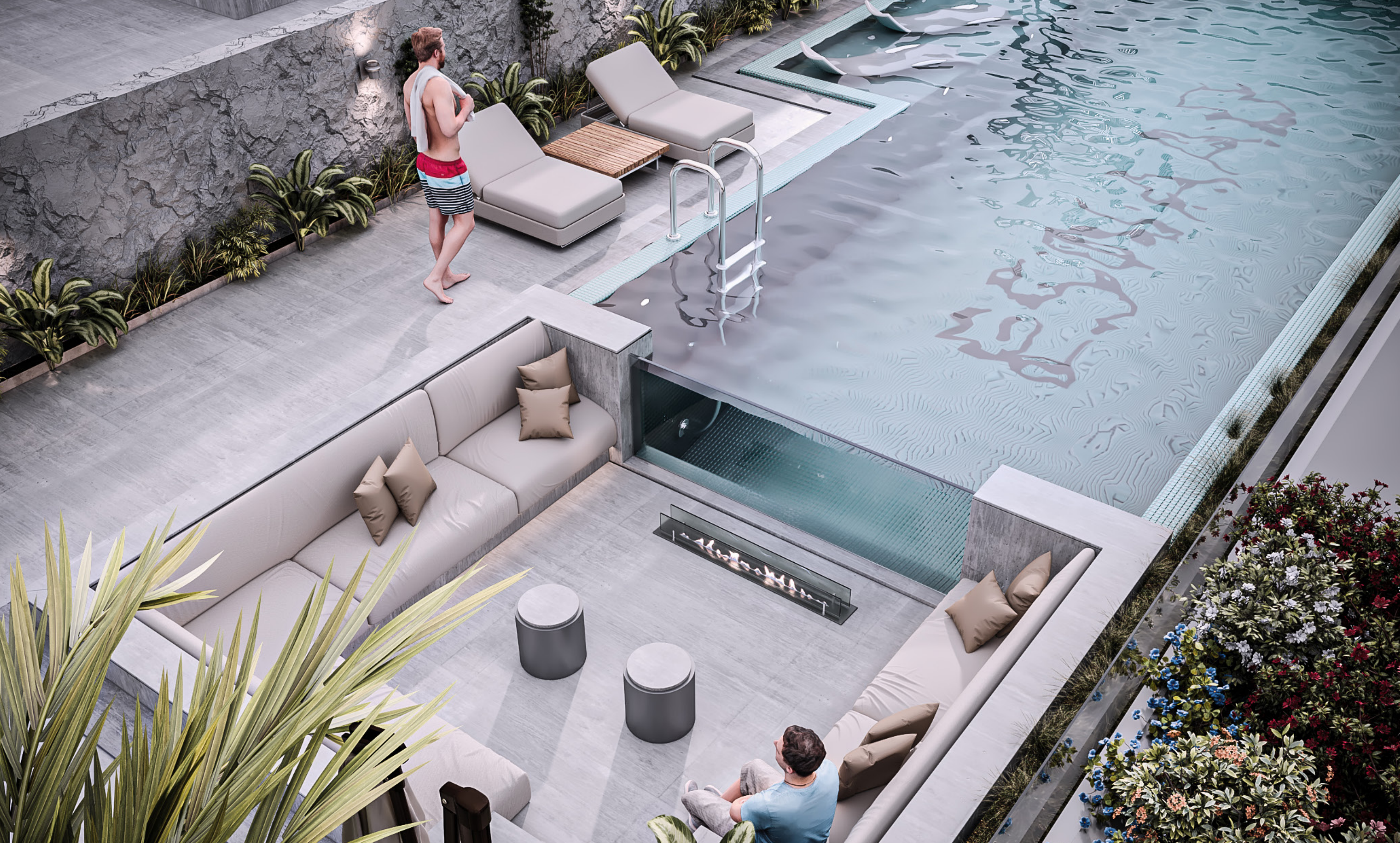
Wimming in Luxury: Opulent Facilities for Unmatched Comfort