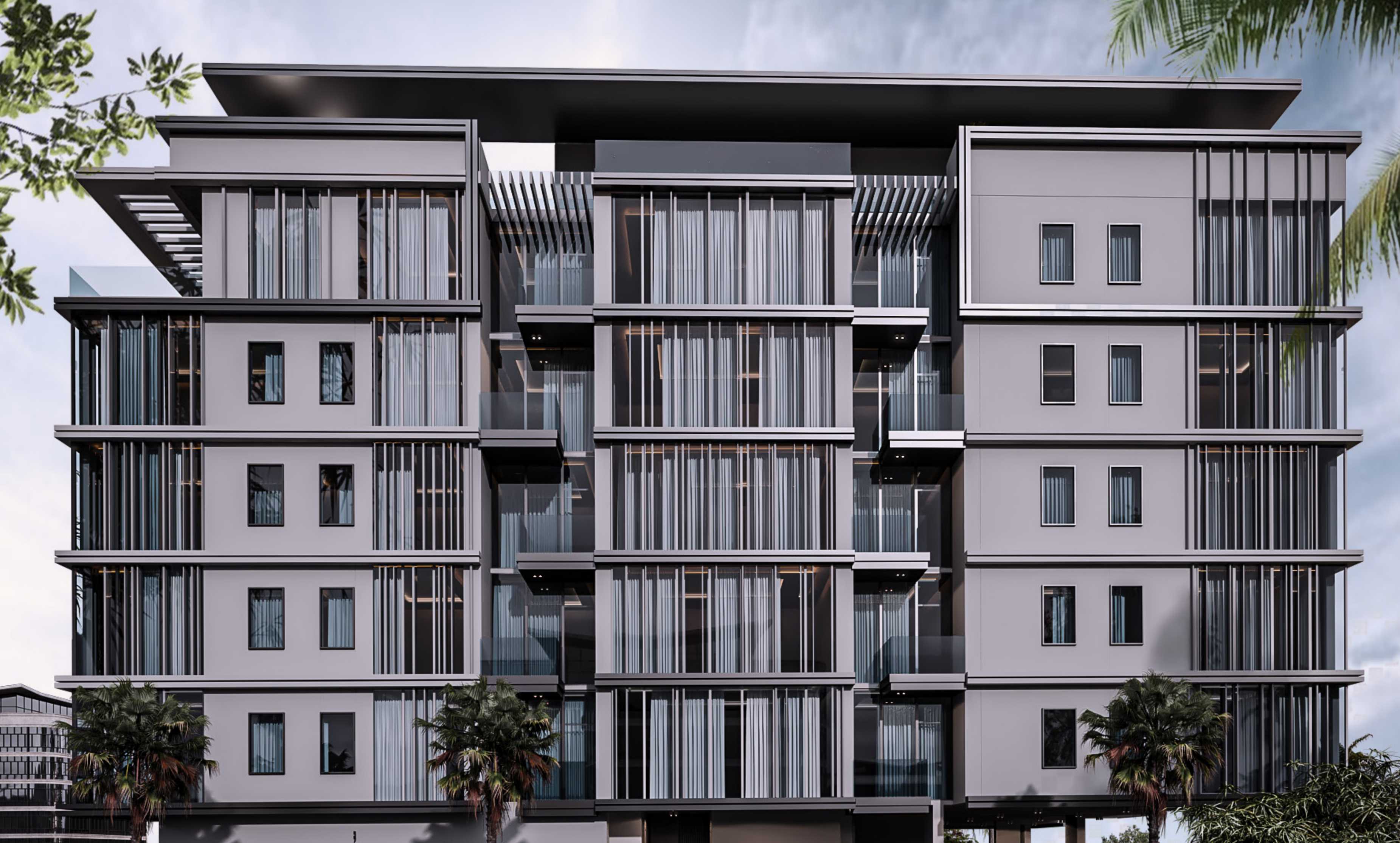
Thriving in Luxury: A Contemporary Lifestyle Redefined