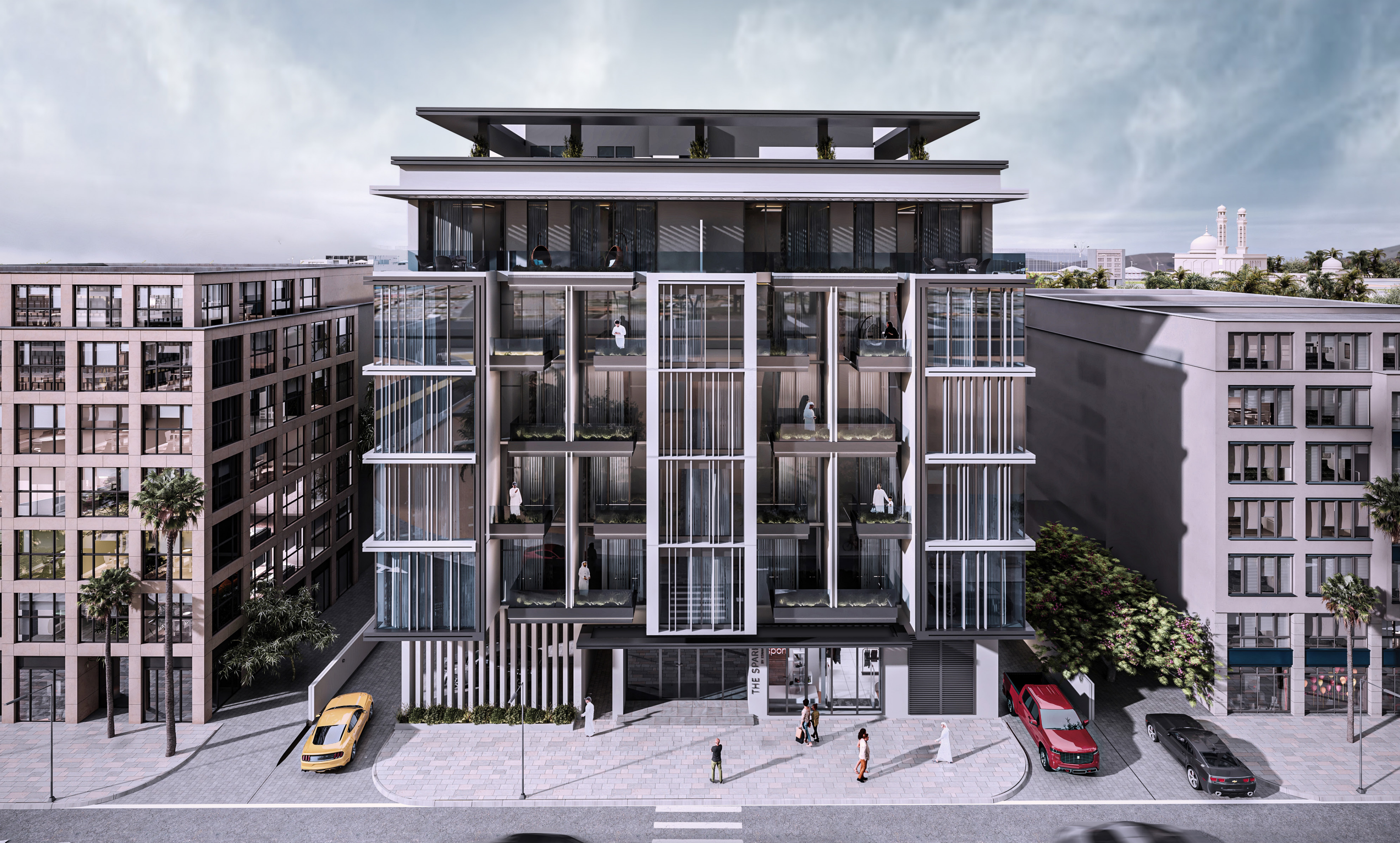
Innovative Design, Nature's Backdrop: A Symphony of Modern Living