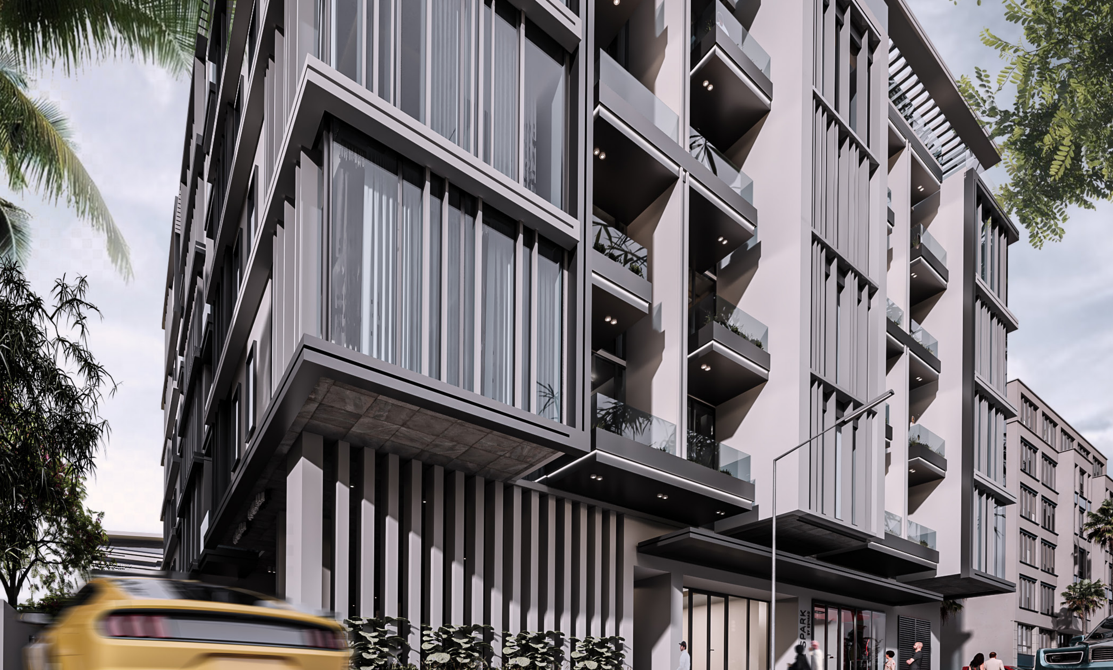
Well-Defined Lines, Luxurious Living: Modern Comforts Redefined