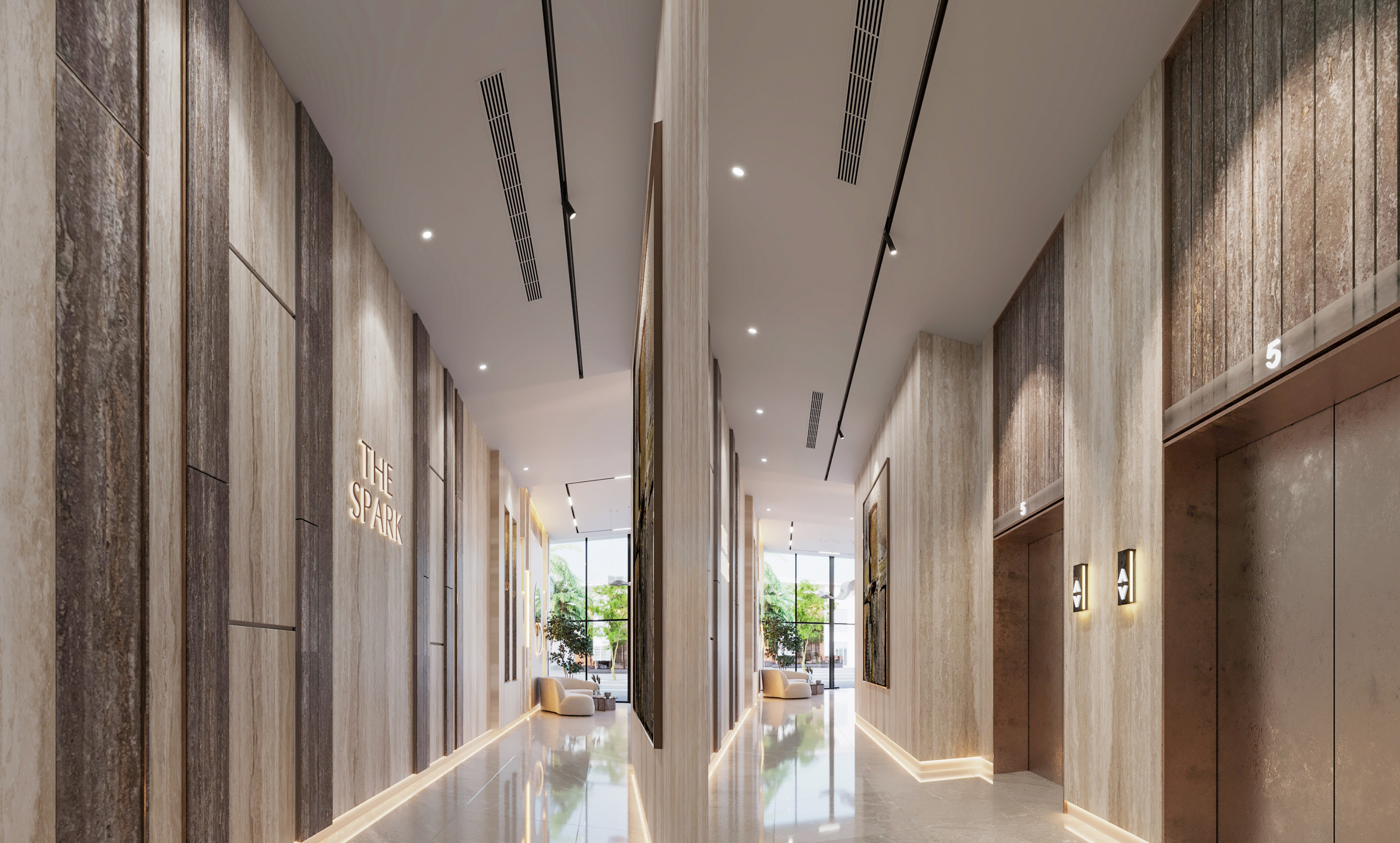
Luxurious Corridors, Premium Materials: Where Every Step Counts