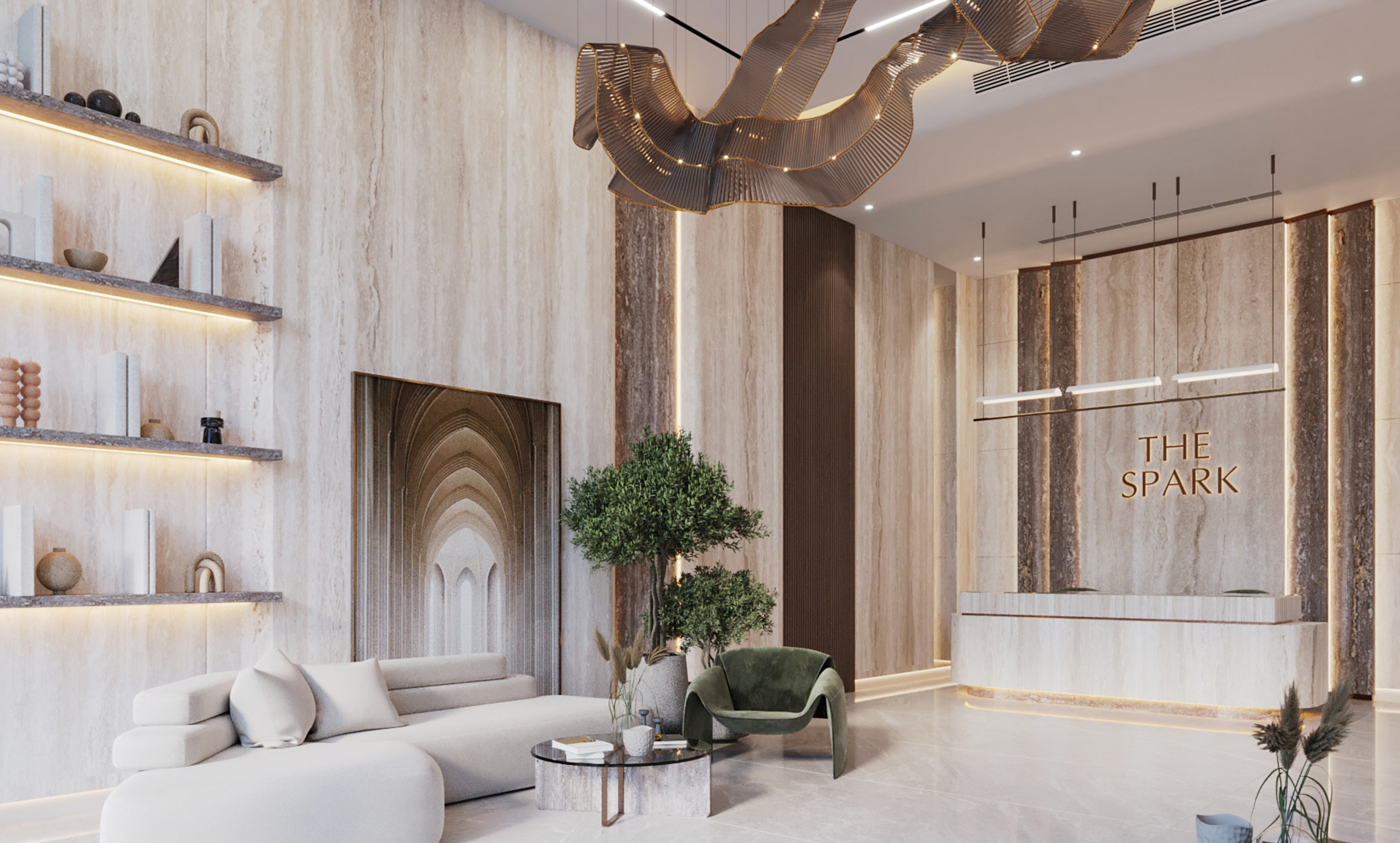
Elegance Welcomes You: Step into Luxury at the Grand Entrance