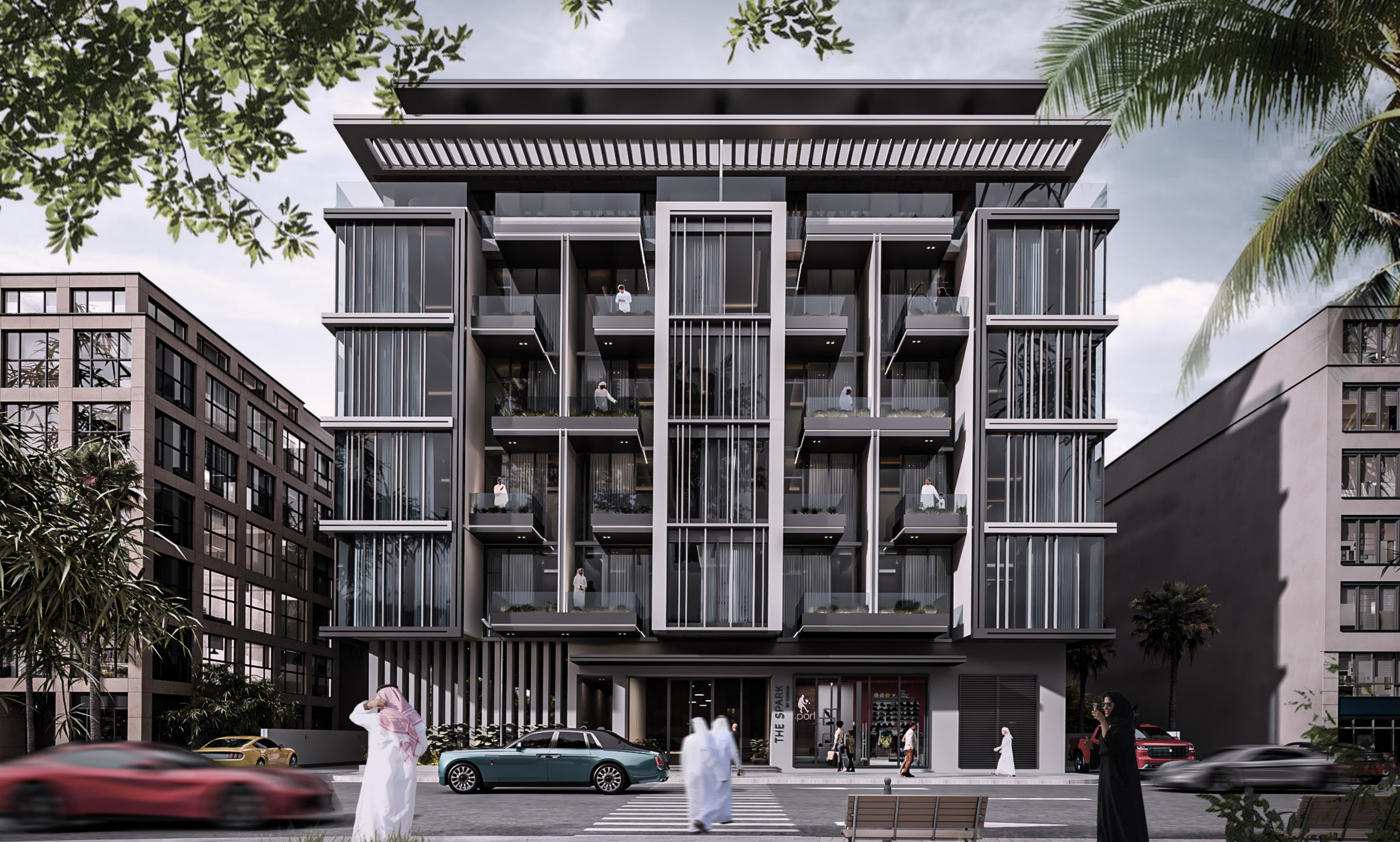
A Symphony of Lights and Lines: Reshaping Cityscapes