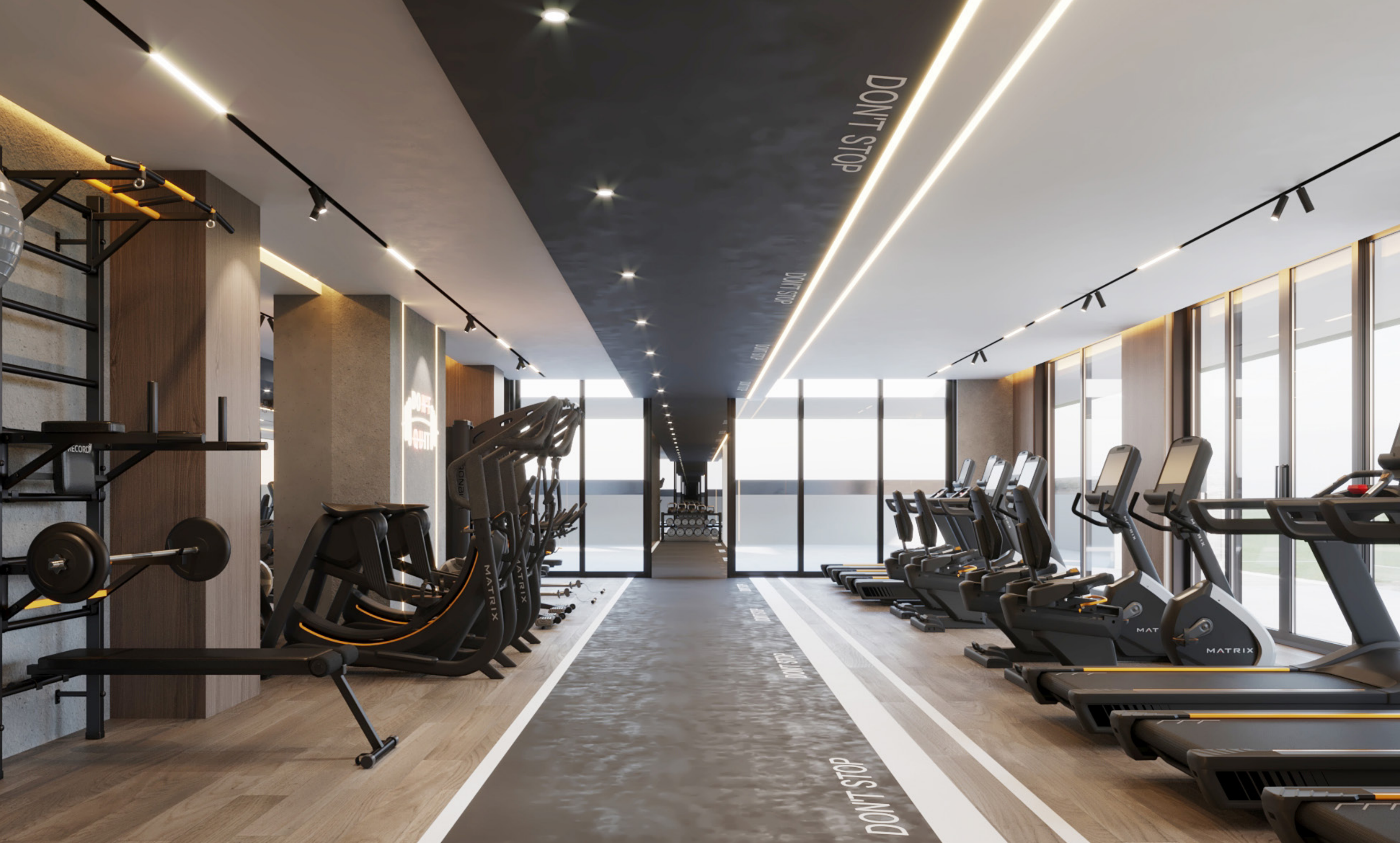
Gym Luxe: Elevate Your Fitness Journey in Style